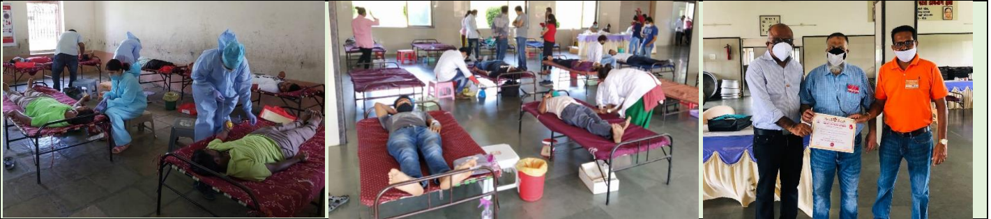
BLOOD DONATION CAMP 26 JULY 2020 – KARGIL DAY