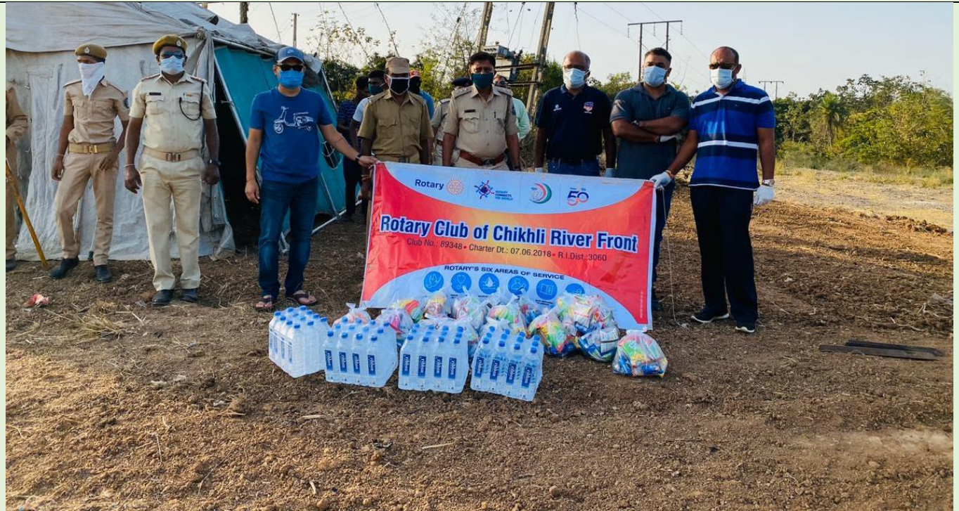
PROVISIONS TO POLICE DEPARTMENT APRIL 2020