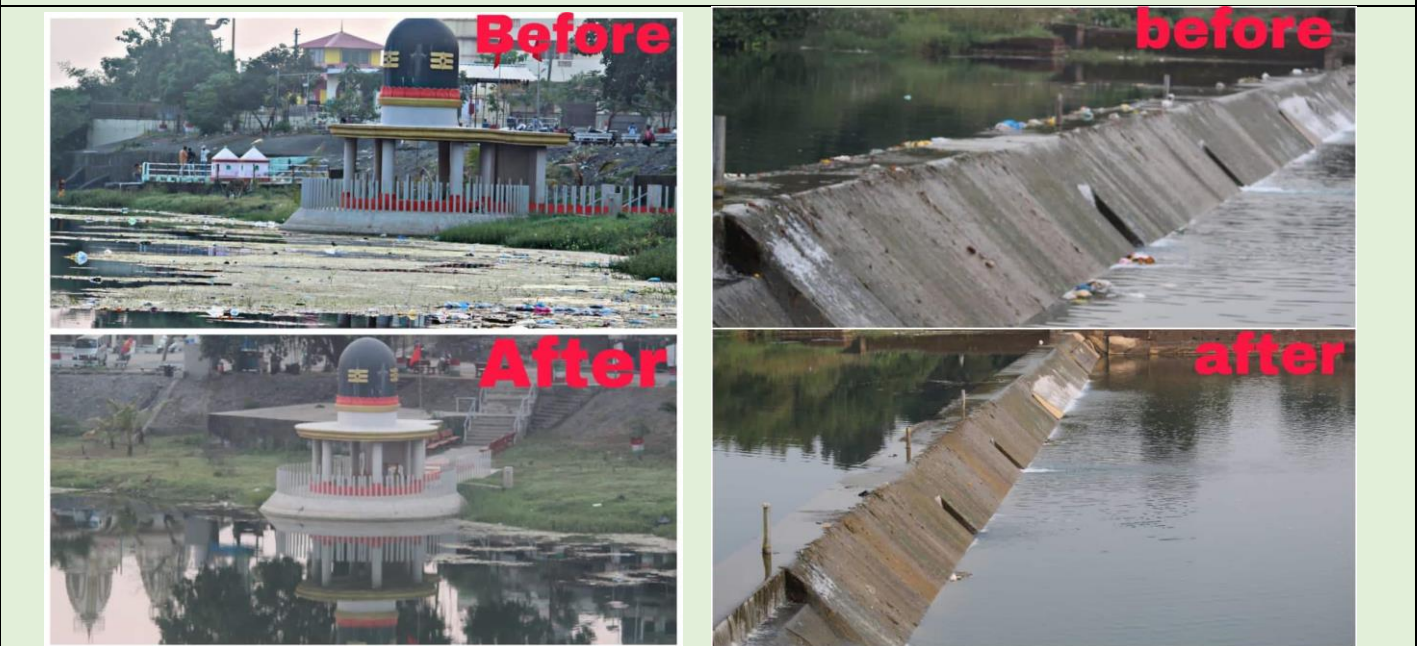
CLEANING UP OF KAVERI