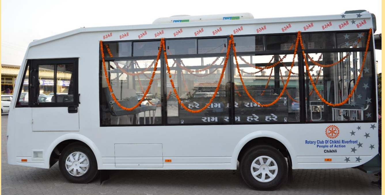
AKSHARYAAN SERVICE : JOURNEY TO THE LAST DESTINATION