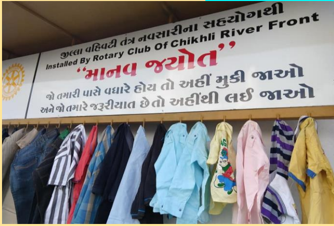
MANAV JYOT: WALL OF HUMANITY