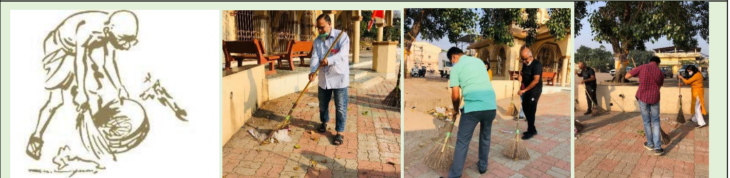
SWACCH BHARAT ABHIYAN- CLEANING OF RIVER FRONT