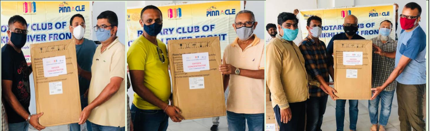
DISTRIBUTION OF OXYCONCENTRATORS AND PULSE OXYMETERS TO VARIOUS VILLAGES