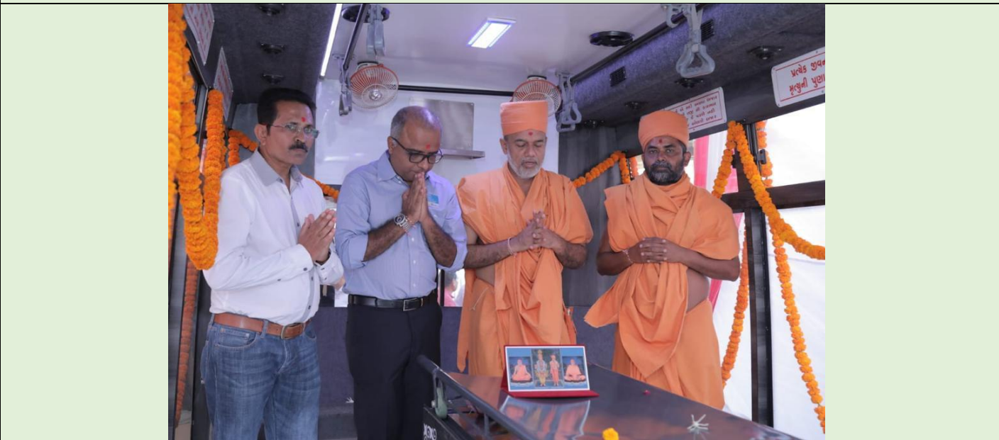
AKSHARYAAN – 2019 INAUGURATED BY SWAMI GYANVATSALDASJI