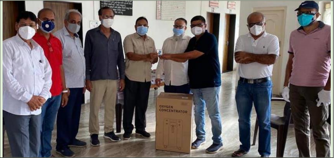
SHREE SAURASHTRA KADWA PATIDAR SAMAJ CHIKHLI