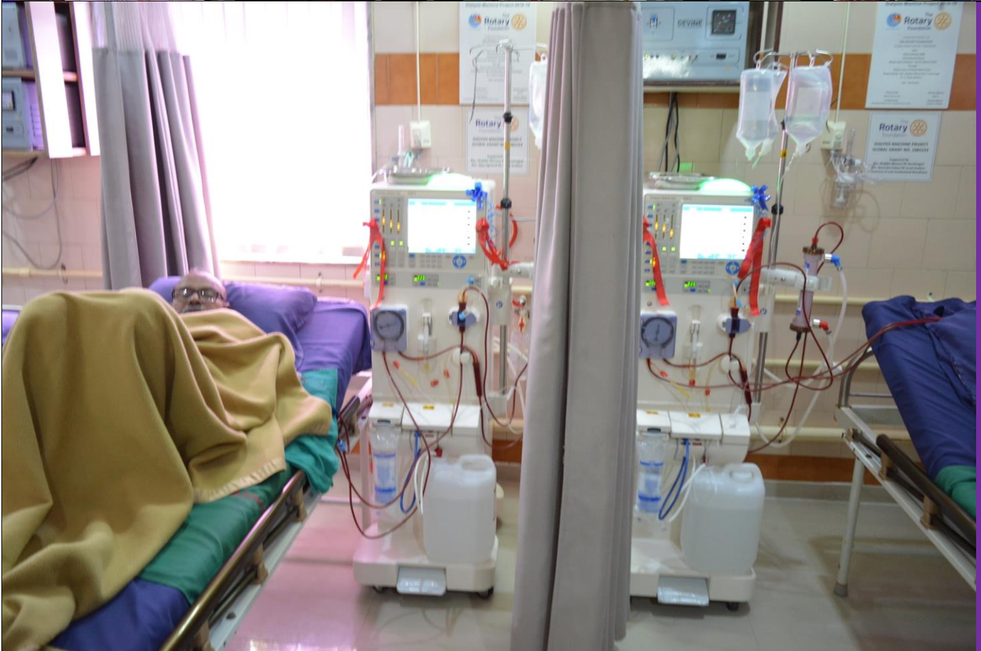
DONATION OF 2 DIALYSIS MACHINES AT ALIPORE HOSPITAL -6 NOVEMBER 2020