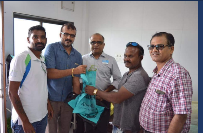
FIRST BLOOD DONATION CAMP 2019 AND TREE PLANTATION DRIVE