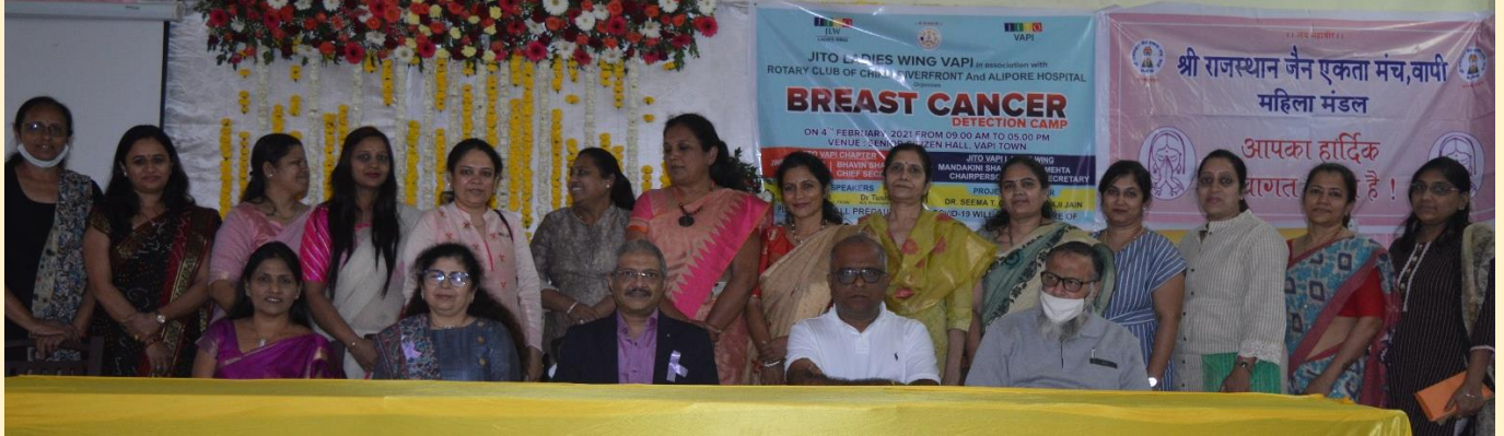
GROUP PICTURE AFTER CANCER AWARENESS SEMINAR