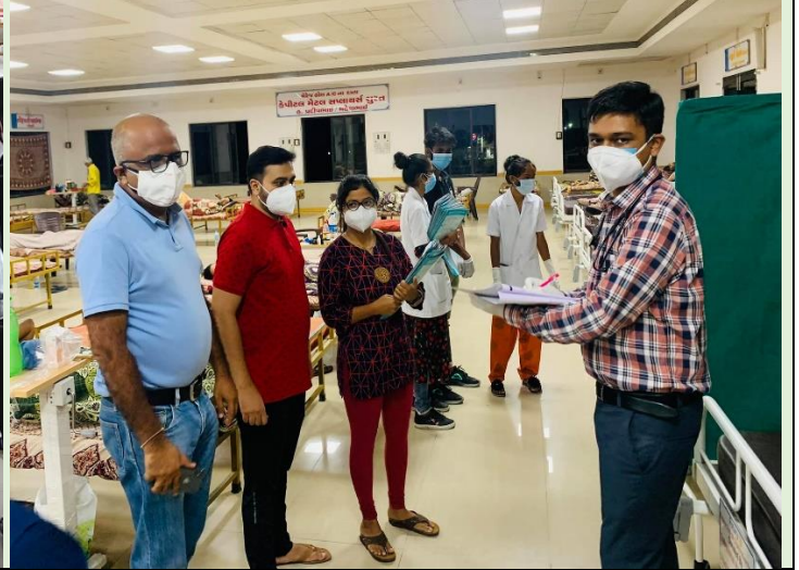
TEAM OF MEDICS IN ACTION