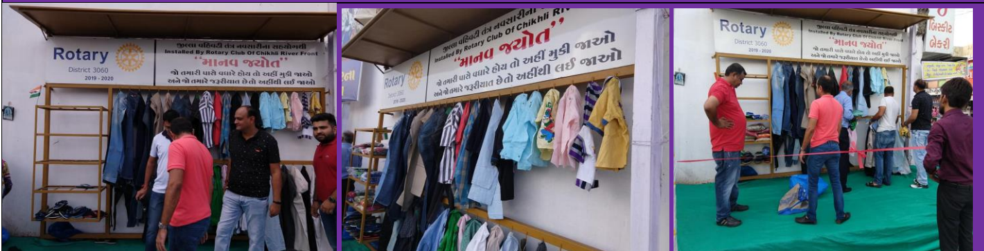
MANAVJYOT – NEKI KI DEEWAR- WALL OF HUMANITY