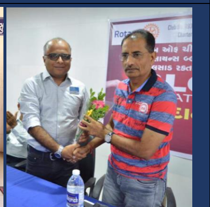
MEDICAL CAMPS ORGANISED IN ASSOCIATION WITH ALIPORE HOSPITAL

THE HAPPIEST PERSONS I KNOW ARE THOSE WHO LOSE THEMSELVES IN THE SERVICES OF OTHERS