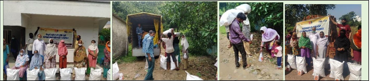
CORONA FOOD KIT DISTRIBUTION