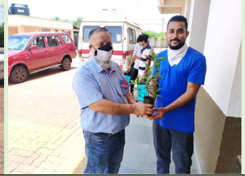
SUPPORTING THE ENVIRONMENT – WATERING TREES, DISTRIBUTION OF TREE SAPLINGS