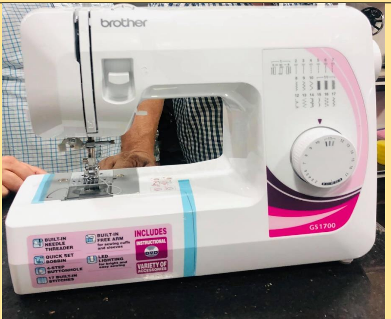
WOMEN EMPOWERMENT CENTRE AT GOLWAD, CHIKHLI