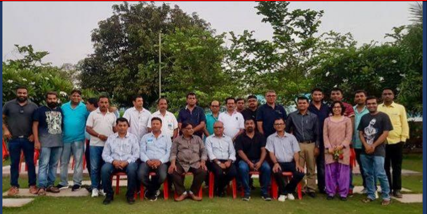
IT ALL STARTED FROM THIS PHOTOGRAPH.....