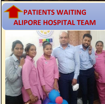
PATIENTS WAITING ALIPORE HOSPITAL TEAM