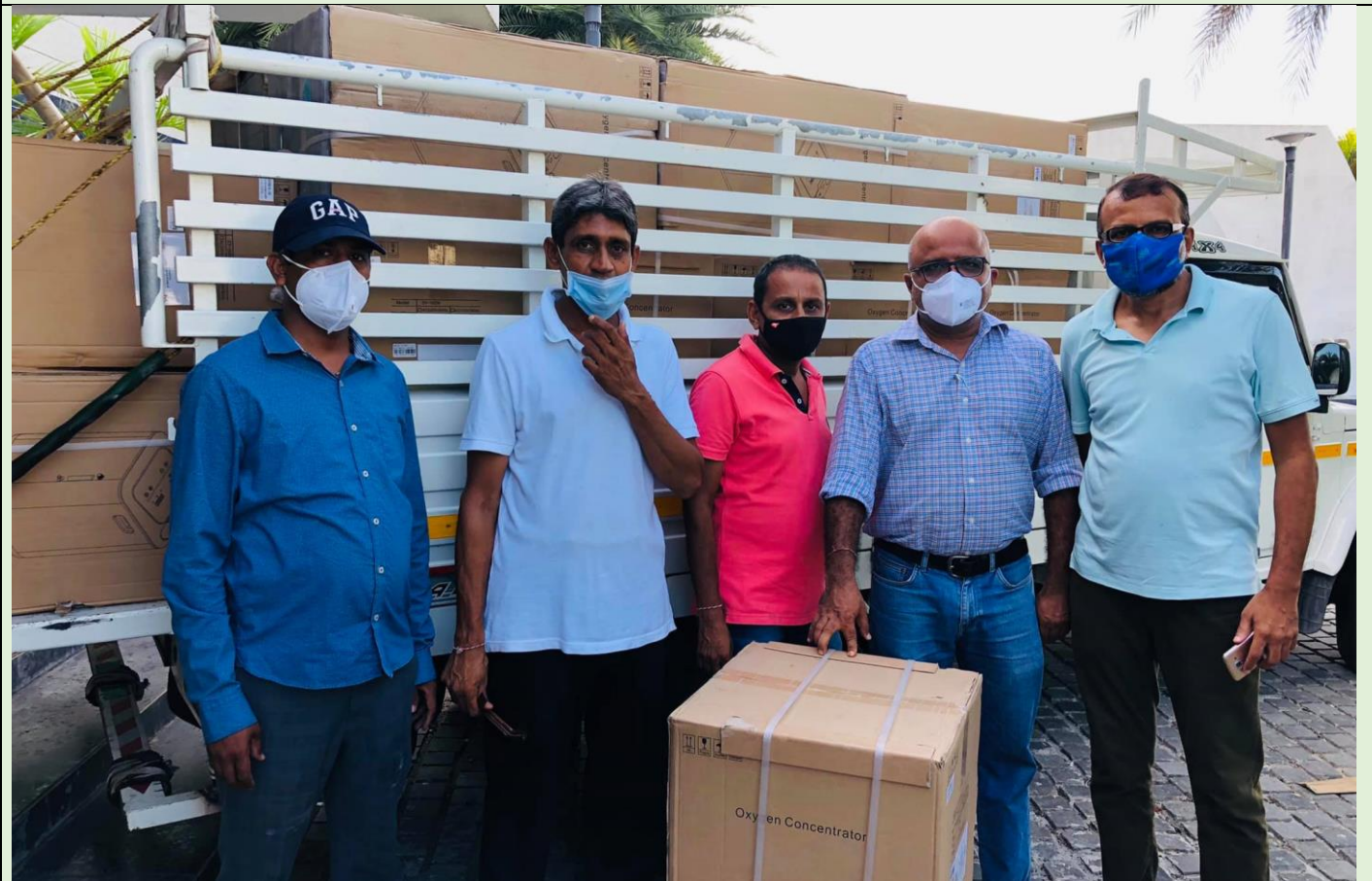
TEAM RCCRF READY TO DO OXYGEN CONCENTRATOR DELIVERY TO VARIOUS VILLAGE CENTRES