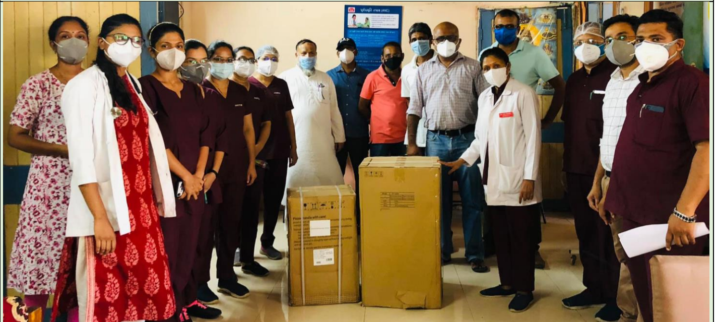
DONATION OF OXYCONCENTRATORS AND PULSE OXYMETERS TO CHC CHIKHLI