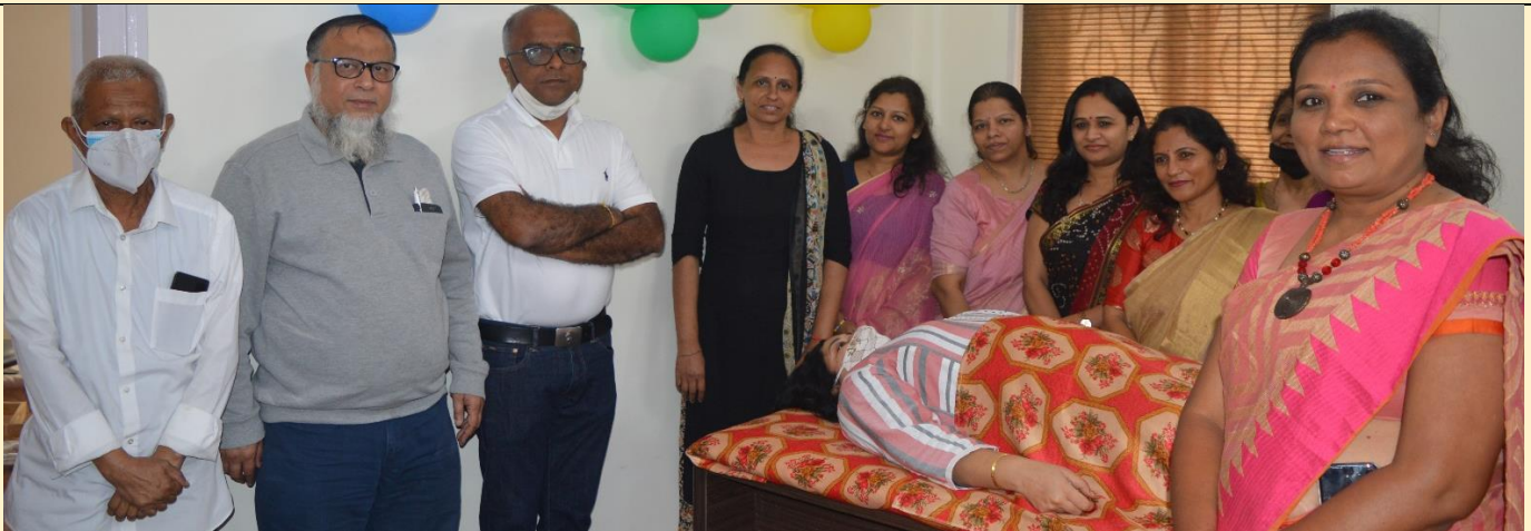
ORGANISERS FIRST PATIENT FOR CANCER SCREENING