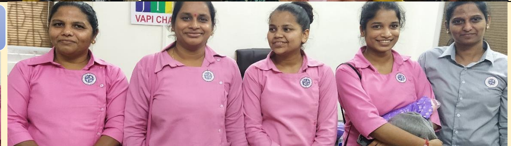
ASWT Alipore Hospital's IBreastExam Team