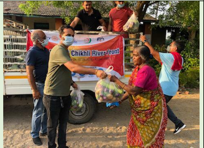
FOOD PROVISION GOING TO THE DESERVING NEEDY DURING THE LOCKDOWN – MAY 2020